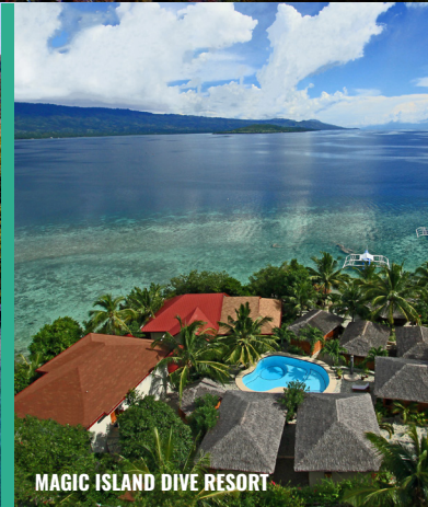
MAGIC ISLAND DIVE RESORT